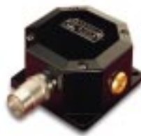
P/N B13-020 polyester housing