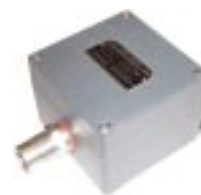
P/N B13-021 High temperature housing