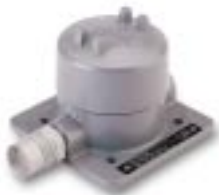
P/N 10252-1, CSA approved, explosion-proof housing